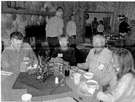
Members at Lunch, Michigania Dining Room

Watch for further details. We hope to see many conference participants there. (See following note on hotel options.)