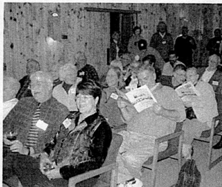
Members Await Film Discussion