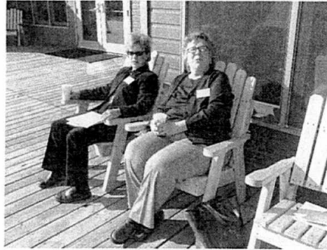
Porch Sitting at Michigania

We encourage everyone to stay at Michigania but are aware the accommodations there are not for everyone.